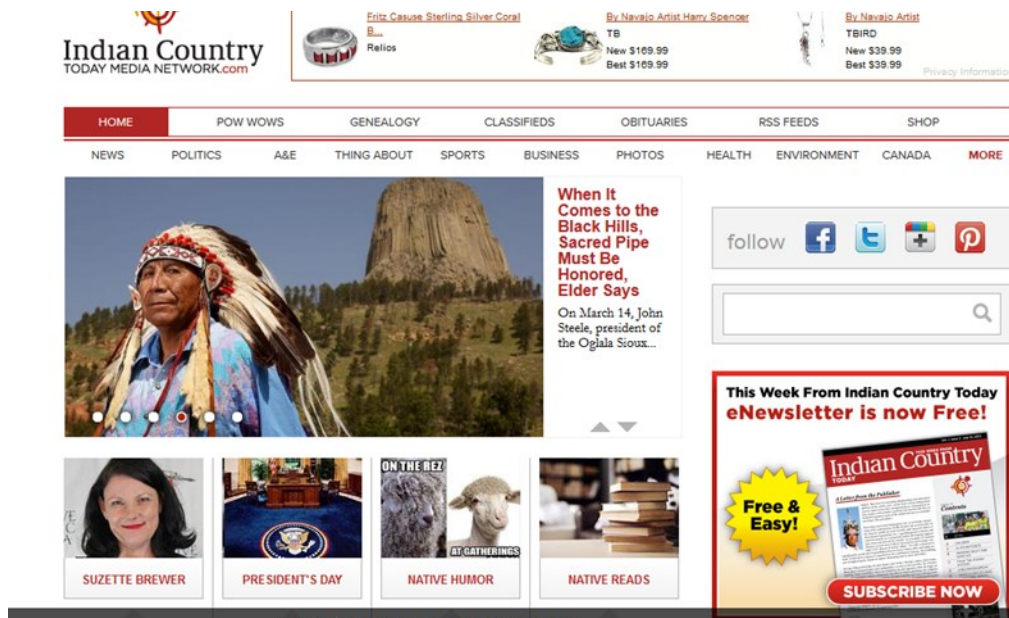
Figure 4. Typical Indian Country story page ( http://indiancountrytodaymedianetwork.com/ )

The Library of Congress hopes to offer full-text search of its Web archives that would provide the missing ability to leapfrog to webpages that have been archived based on RSS feeds, however this type of search is at least several years off. 10 Our present goal is to achieve greater completeness in what we acquire from news sites despite the possible access limitations to some of these materials. One short-term solution would be to provide links to the harvested RSS feeds as well as the homepage of the archived website, in order to navigate to these materials. In the long-term, we think full-text search will be the most efficient way to find such content in archives with billions of documents and millions of pages. It also seems likely that the absence of browsable links for such sites will be unimportant for advanced use cases such as textual analysis using nGram viewers.