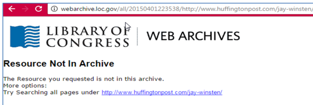
Figure 2. An example of a “Resource Not in Archive” in the Library of Congress Web Archives

In analyzing what was crawled and comparing to what was not crawled (the URLs remaining), the reports suggested that materials were not harvested, resulting in what we would have in our collections as incomplete. Anecdotally, in what could be called a hands-on “click-click” quality review of the result, too many documents turned up “Not in Archive” (see Figure 2) as we randomly clicked through pages in the archived version of HuffingtonPost.com.