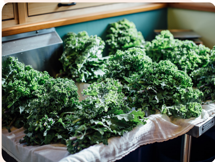
Facebook photo of sorted kale to be included in Easy Bee Farm’s Weekly 2016 CSA Share, Moab UT.

The next major step to CBSM is to enact the strategies through a small-scale pilot test of your CSA and make alterations in order to find what works best. Once your CSA and marketing communication are successful, then it can be implemented on a larger scale. The final step is to assess how consumer behavior has changed. For example, you can measure the number of subscribers to a blog, electronic newsletter, Facebook page, Twitter, YouTube, or Instagram account. Another example is to calculate the number of registered shareholders in relation to previous seasons.