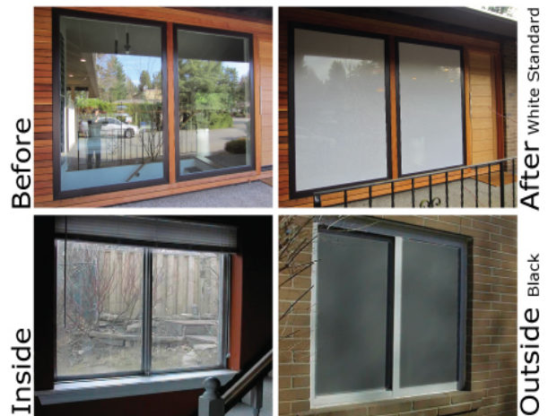
Figure 4. Various patterned films designed to prevent bird window collisions. Films are transparent on one side and reflective on the other.