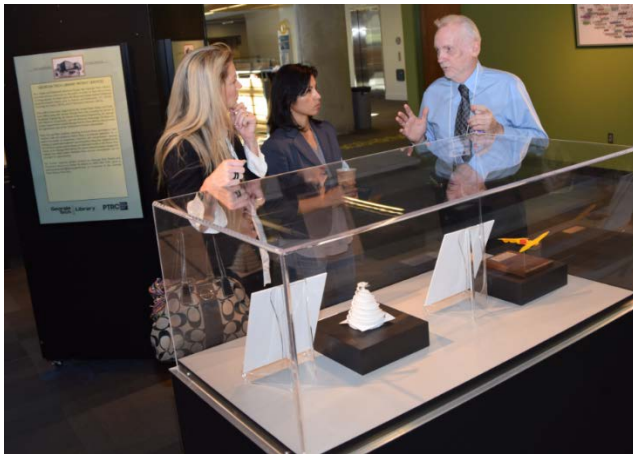
Photo 2: Inventor talking to participants in front of his invention model exhibit case.