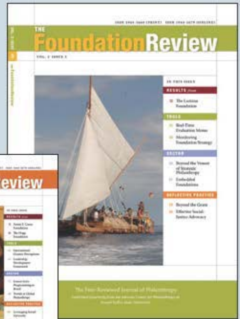
The Foundation Review is the only peer-reviewed journal of its kind; it is published quarterly by the Johnson Center.

Johnson Center and it provides us with all kinds of valuable research and information. I feel like it's starting to truly get the statewide and nationwide attention it so clearly deserves."