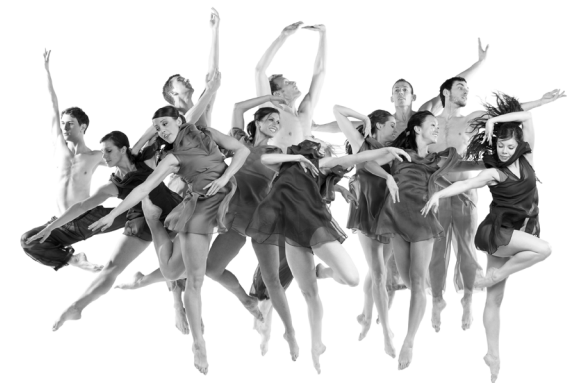
The next Fall Arts Celebration event highlights Vivaldi's 'The Four Seasons.'

reception. For more information, visit www.gvsu.edu/fallarts, or call x12180.