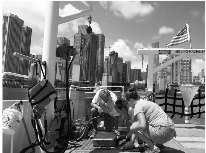
AWRI earned an EPA grant to continue its Great Lakes education and outreach programs, like this one in Chicago.

vessels, the W.G. Jackson , for most of the tour activities. The boat is 65 feet long and takes more than 3,300 adults and students on water quality sampling excursions each year. The purpose of the port visits is to spread the word about the Lake Michigan Lakewide Action and Management Plan for Lake Michigan. AWRI's other vessel, the 45-foot long D.J. Angus , has been used for teacher workshops, which are another part of