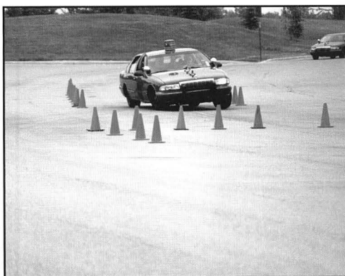
The summer police academy training included practicing driving techniques on a specially marked course.

Fisk says there are 22 police training programs in the state, graduating between 1,500 and 1,800 people every year. Of the 600 Criminal Justice majors at GVSU currently, about one-third of them go on to law