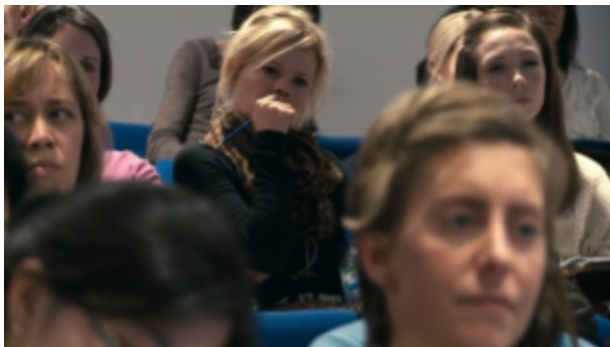
Therapists in training.