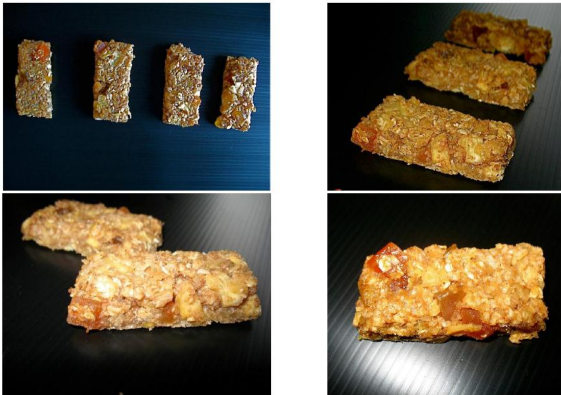
Figure A1. Breadfruit bar.