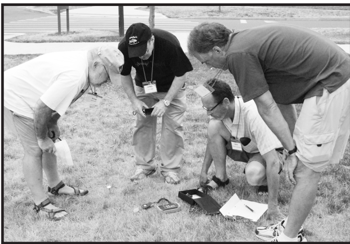
IPY 2010 PARTICIPANTS listing on pg. 11

Teachers provided overwhelmingly positive feedback about this institute and expressed appreciation to the staff for the well organized and interesting material, including an impressive amount of material put online on the Institute's website, http://umassk12.net/ipy ■