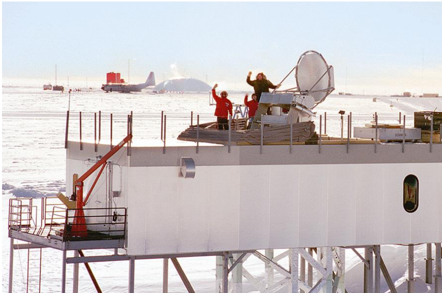
Figure 1.UMass engineering researchers in the Terahertz Lab have developed specialized sensors which have been installed in Antarctica at the Amundsen-Scott South Pole Station. Note the specialized aircraft, buildings, and radar.

Many future polar researchers are enrolled in rigorous courses taught at the high school level, especially those that prepare students for SAT II and AP exams. Given the constraints that teachers of these courses may have in terms of integrating multi-lesson modules into a carefully structured curriculum, modules that provide a variety of sophisticated activities with a narrower focus may be more effective. Therefore, in addition to the Polar Connection Modules previously described, additional Polar Connection Modules will be developed that focus on a variety of specific topics in Biology, Chemistry, Physics, Environmental Science, Earth and Space Science, and Information Technology. One example would be a Polar Connections Module developed for high school physics courses.