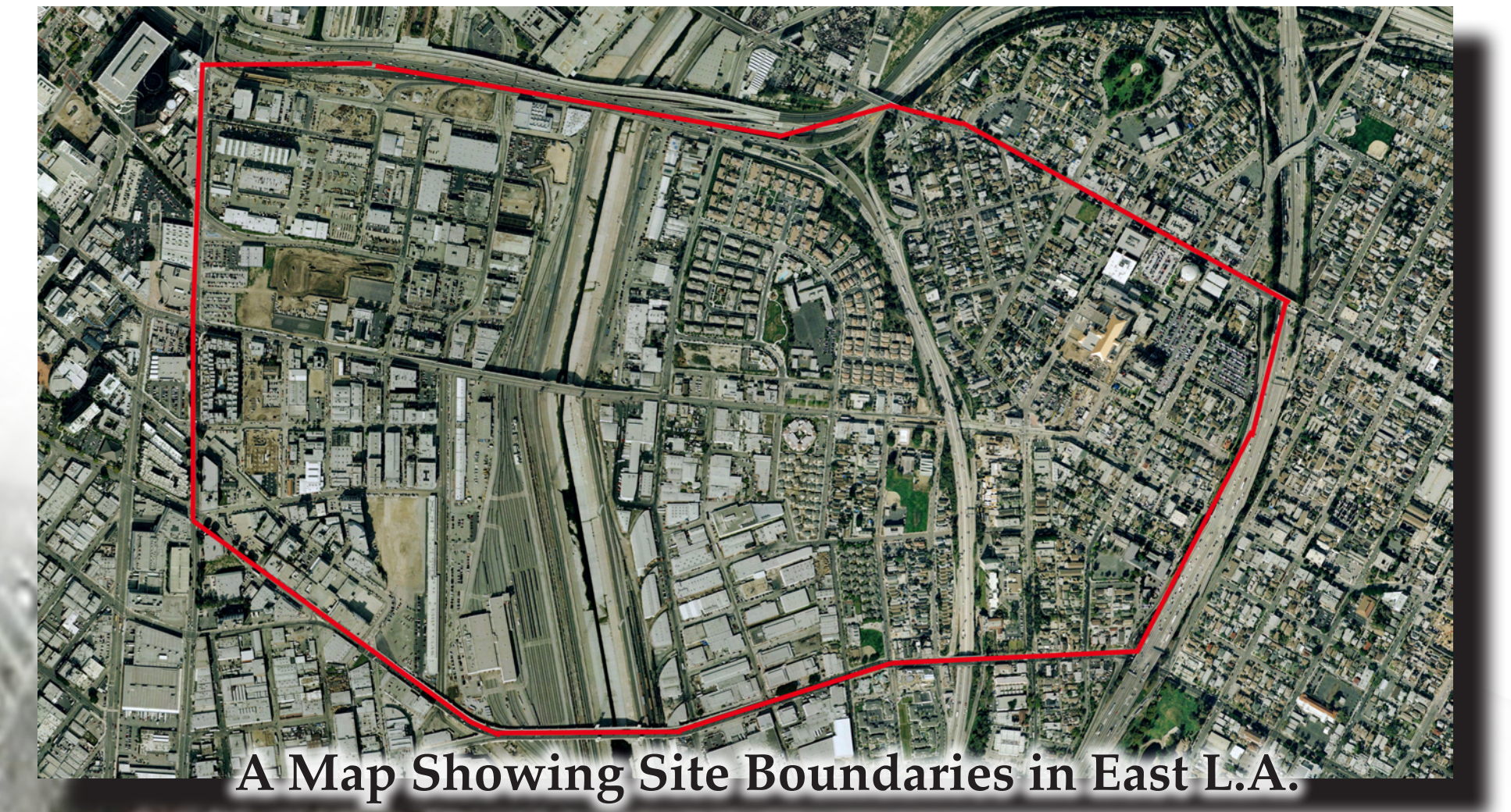
A Map Showing Site Boundaries in East L.A.