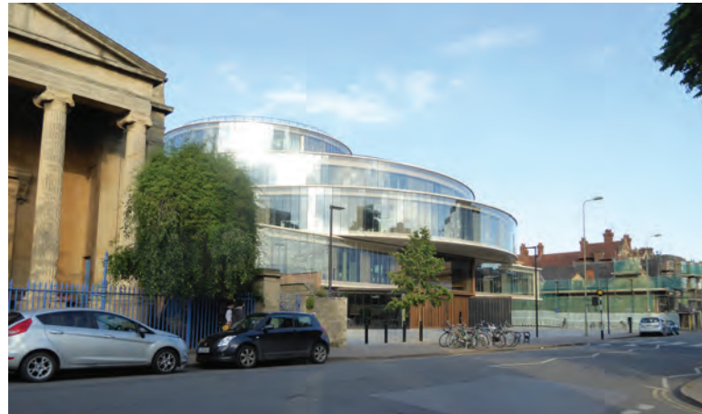
Figure 1: The Blavatnik School of Government, University of Oxford, by Herzog and de Meuron.