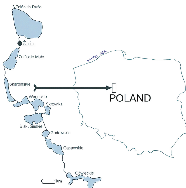
Fig. 1. Location of the objects of study.

For these and other reasons the subject of lake evolution is one of the main trends in limnology. Modern lake disappearance analyses usually focus on lake surface area changes (Lei et al. 1998, Yin et al. 2005, Peng et al. 2005, Su et al. 2006, Gao et al. 2011, Guo et al. 2007, Du et al. 2011, Marszelewski et al. 2011, Choiński et al. 2011, Tarasenko et al. 2012, etc.) – overlooking or marginalizing the second factor which contributes to lake disappearance, i.e. the process of shallowing of lake. Yet another approach is based chiefly on paleolimnological research methods, where the evolution of lakes is analyzed on the basis of a shallowing scale (Anderson 1990, Friske 1996, Smoot J. P. & Joseph G. 2002, Yemane G. D. & Nyambe I. 2002, Ahn et al. 2006, Kossoni A. & Giresse P. 2010, Sloss 2010, Bazarova et al. 2011, Trabelsi et al. 2012, etc.). Both these aspects, i.e. the assessment of the changes in surface area and the role of shallowing, have rarely been brought up together. As evident from the earlier works approaching the evolution of lakes in the manner referred to above (Choiński 2002, Choiński & Ptak 2009, Ławniczak et al. 2011), the rate of lake disappearance understood as the decline in aquatic resources is up to several dozen percent higher than the value of surface area decline „visible to the eye”. The foregoing data encourage further analyses, which may develop the ideas of the evolution and future functioning of lakes.