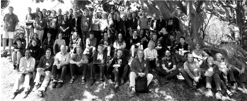
Figure 2: Group photos of the attendees of the 2016 Boden Research Conference 'Animal, Vegetal, Mineral', taken during a rare break in otherwise incessant rain. The conference was attended by 76 scientists, including 50 international participants, with 11 keynote lectures, 10 invited talks, 27 contributed talks and 23 poster presentations.