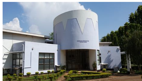
Photo 2. Kilimanjaro Clinical Research Institute, Moshi, Tanzania (top), and the welcome sign to the bespoke Zoonoses lab set up within KCRI to enable One Health research (bottom).

An unintended consequence of the separation of laboratories and staff processing human and animal samples is lack of communication. For example, our research team was involved in anthrax diagnostics on animal-derived material and was not aware of the availability of molecular diagnostics for anthrax in human samples in an adjacent laboratory until a discussion about diagnostics was sparked by the occurrence of human anthrax in northern