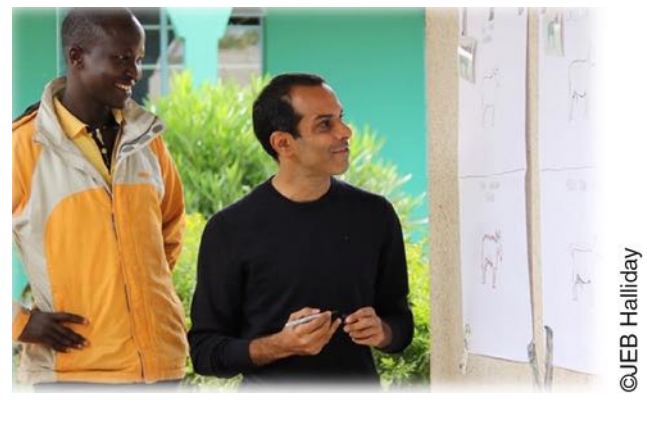
Photo 1. Development of bespoke cartoons in consultation with Tanzanian end-users to create culturally appropriate communication tools for One Health research.

genuinely understood the research goals, nor had they had time to reflect on whether or not to take part in the study. This is not a new problem in development research. The standard consent process of a single meeting between investigator and volunteer may be insufficient for adequate comprehension of informed consent. 22 Indeed, Sreenivasan argues that full comprehension is rarely achieved in research and should be considered an ethical aspiration rather than a minimum standard, 23 claiming that if full comprehension was a necessary condition of valid consent then much scientific endeavour would be impossible. To protect prospective research participants, their level of understanding can be assessed prior to consenting. Cooper and colleagues used comprehension and engagement scores to test the effectiveness of 3 communication tools—written documents, illustrative photographs, and illustrative cartoons—when providing study information to 22 Tanzanian livestock keepers prior to consent. 21 Cartoons were associated with significantly higher engagement scores, highlighting the usefulness of alternative means of information provision.