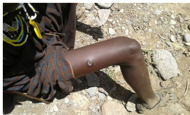
Photo 4. Cutaneous anthrax in a resident of the Ngorongoro Conservation Area where anthrax is an endemic disease with seasonal peaks in wildlife, livestock, and human case numbers.