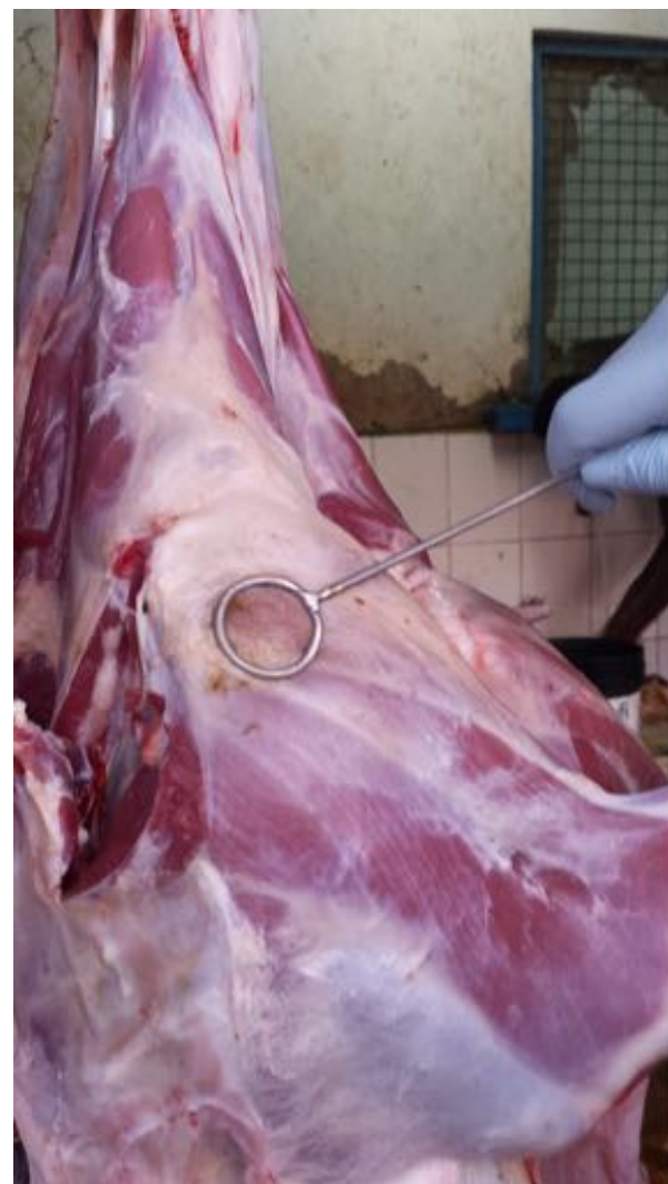
Photo 3. Staff training in standardized methodology for carcass swabbing to support slaughterhouse-based surveillance of meat borne pathogens such as non-typhoidal Salmonella and Campylobacter species. Moshi, Tanzania.

actual bacteria, which is difficult to obtain due to low levels of bacteremia in patients, transient bacterial shedding by infected animals, and constraints on culture of the organism. Using serological data from field studies and sophisticated modelling approaches, goats were implicated as the most likely source of human infection in northern Tanzania. 54 This study also used simulated data to show that even small amounts of data on bacterial species identity—or comparable subtyping—are sufficient to inform models aimed at quantifying transmission between host species, thus justifying