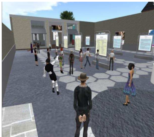
Figure 2. The project information boards in the PREVIEW-PSYCH main area in Second Life®.

Participants first went through inductions into SL before moving onto the PREVIEW-Psych project area. The participants worked in small groups using the problem statement (see Appendix 2) to establish whether the virtual child was safe within the existing family environment where multiple psychological and social issues were present (e.g. dementia, anorexia, alcoholism). A written response to the statement was required, using materials provided around the PBL area and within the house itself. Participants worked together to establish the virtual family dynamics, using the information provided within the PBL area, and the impact it had, along with collating basic information about these clinical disorders and the theoretical perspective in psychology which they considered most appropriate as a starting point for treatment.