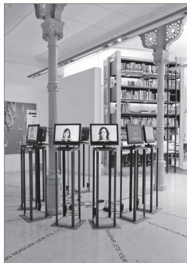
08 / 09 Aorta: Subtle Revolutions

PRACTICING RESEARCH: SINGULARISING KNOWLEDGE