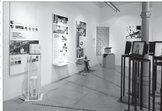
07 | 09 Aorta: Subtle Revolutions

Recently, the annual lecture series known as the Reith Lectures, commemorating John Reith the founder of the broadcasting company, began on the BBC. This year the lecturer was Martin Reese the president of the Royal Society of Astronomy. He began by looking back to the 17 th century emergence of aristocratic, self taught, scientific amateurs, who gathered out of passionate curiosity about the natural world – formed societies, exchanged books, reviewed each others experiments and theorems, and formed the first professional, learned associations devoted to uncovering radical new knowledge such as the Royal Society in 1660 – when a dozen men gathered to hear the young Christopher Wren give a lecture on astronomy. In the discussion that followed, they decided to