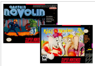
Figure 1: The first diabetes educational video games, for SNES. Left: Captain Novolin -1992. Right: Paky and Marlon -1995

★ Constructivism posits that exploration and problem solving create the context in which learning occurs in the pre-operational children stage.