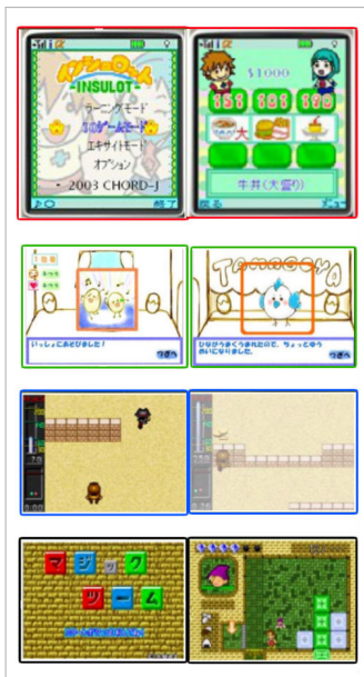
Figure 3: Feature phone games. From top to bottom: Insulot 2005 - slot game for carbohydrates measuring, Egg Breeder 2004 - Breed a diabetic egg until it hatches, Detective 2004 - Help a diabetic detective to catch a villain, Building Blocks 2004 - Block building game

The concreteness of the plastic food toys, used in Yorkhill, and their depiction of real world objects are the base line for constructivistic “hands-on” learning. According to that, and in order to avoid perturbing the existing ecosystem, we decided not to alter the existing approach but enhance it through technology by adding all the missing features.