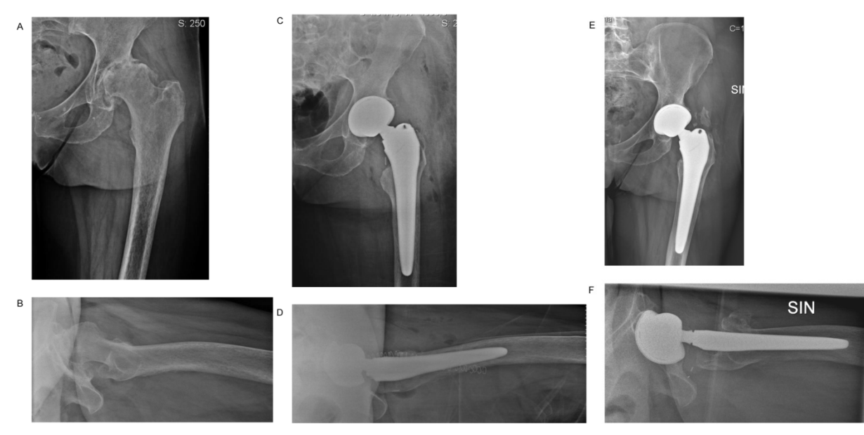
Figure 5. Female, 56 years old. Severe rheumatoid arthritis. Cementless total hip arthroplasty, coated with vancomycin 5% loaded DAC hydrogel. A and B. Pre-operative x-ray. Immediate (C and D) and (E and F) postoperative radiographic images at 18 months showing complete implant osteointegration at follow-up.

PJI denotes prosthetic joint infection; MRSA methicillin-resistant Staphylococcus aureus ; MSSE methicillin-sensitive Staphylococcus epidermidis ; MRSE methicillin-resistant Staphylococcus epidermidis ; BMI body-weight index (weight in kg divided by height in meters squared)