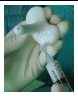
Figure 4. The hydrogel can be applied to modular parts, as shown here on the polyethylene tibial insert of a revision knee prosthesis, to provide a complete surface protection.