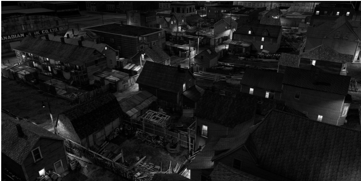
Stan Douglas Hogan's Alley (2014)

been taken over by homeless WWII veterans in the immediate post-war period before eventually being razed in 1949. The now demolished Hogan's Alley was a post-war red light district known for its illegal drinking establishments, brothels and gambling dens. It's described within the Circa 1948 app as a place where "Immigrant workers, drifters, and dreamers rub elbows with politicians and cops on the take."