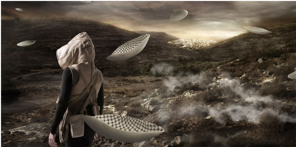
Larissa Sansour In the Future, They Ate from the Finest Porcelain (2015)

artist to engage in an indirect, yet provocative investigation of the current politics of the region and thus to re-open the question of the future of Palestine.