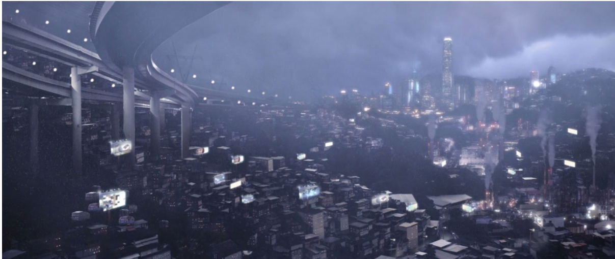
Liam Young New City: Edgeland s (2014)