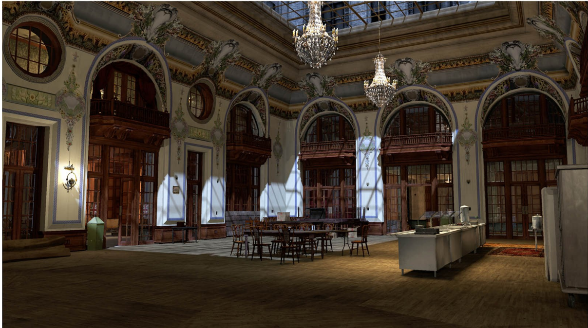
Stan Douglas Circa 1948 (2014)

reconstruction process involving the use of “a computer programme to apply photographic images (textures) to three-dimensional geometry (meshes)” (13). The Circa 1948 app, employing a first person point of view common to video games, allows users to navigate through the two locations, eavesdropping on conversations that form a disjointed narrative of political corruption and shady development plans. 2 As Douglas suggests, “We get a sense of the various real estate scams that are going on in this post-war period, and a lot about the reorganization of urban space...” (POV interview). In 1948, Hogan’s Alley and its surrounding streets constituted one of the most ethnically diverse areas of the city and home to one of the only black communities in Vancouver at the time. This area of Strathcona has a long history of resisting the threat of demolition that came with each urban renewal project, Hogan’s Alley itself being eventually razed in the 1970s in preparation for the construction of the Georgia Viaduct overpass (originally planned as part of an extensive freeway system).