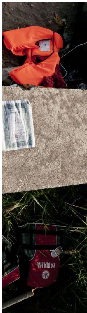
Photo 2 Belongings and documents found on the shores of Lesbos

Still there is a tension between legal duties and the realities of a complex humanitarian challenge. At the peak of the refugee crisis it was practically impossible for the understaffed coastguard to carry out such an investigative operation. In the last half of 2015 the daily arrivals of refugees ranged between 2,000-3,000, 29 and therefore it would be unreasonable to expect from an under-resourced state agency at a remote Greek island mandated to collect and register thousands of living migrants, to search for and rescue the missing, to deal with the dead bodies, and at the same time to carry out a systematic and time-consuming investigation to collect and store post-mortem data from shipwrecks. Yet, according to all available information lack of provision for collecting post-mortem data was prevalent even in the previous years (2013-2014) at a time when the few shipwrecks made the collection and storage of this data more feasible. As such this should be seen both as the objective challenges of a complex humanitarian challenge and a continuation of a bad practice.