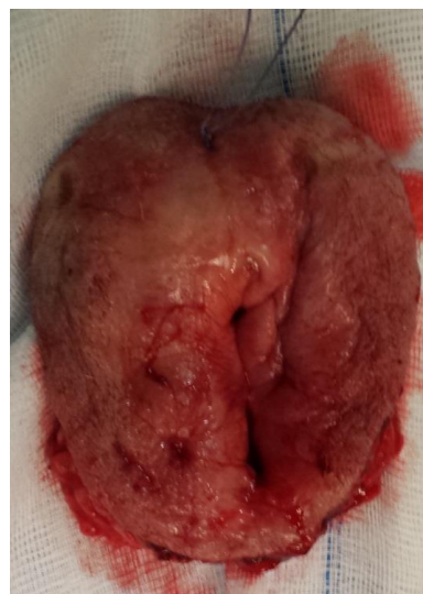
Figure 4. The biopsy specimen was sent intraoperatively to pathology for urgent analysis in order to determine whether or not the margins were affected

The area of the vulva to be excised was first delimited, taking into account surgical margins of 3 cm (Figure 2). The vulvectomy was then performed using a monopolar and bipolar electro-surgical device and the biopsy specimen was sent to pathology for an intraoperative study (Figures 3 and 4). It was concluded that there was an absence of tumor cells in the biopsy specimen. The surgeon then proceeded with designing the suprafascial flap (i.e., in the form of a "lotus petal") as shown in Figure 5 and carried out the vulvoperineal reconstruction. The gluteal-fold flaps were drawn and adapted to the size of the defect (Figure 5). The flap, including the deep fascia, was then raised towards the defect and inserted inside the latter (Figure 6). Finally, the skin closure was completed in two layers. The final result showed no open defects (Figure 7).