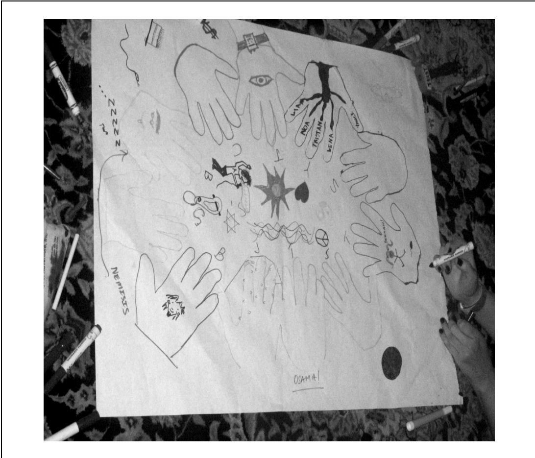
Figure 2: Completed Full Value Contract