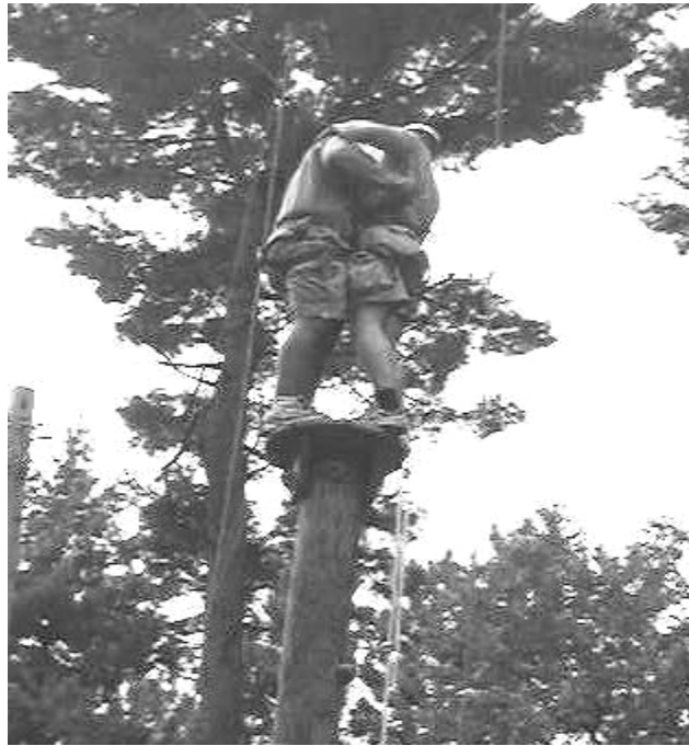
Figure 3: Body position and spatial relations on pole climbing element