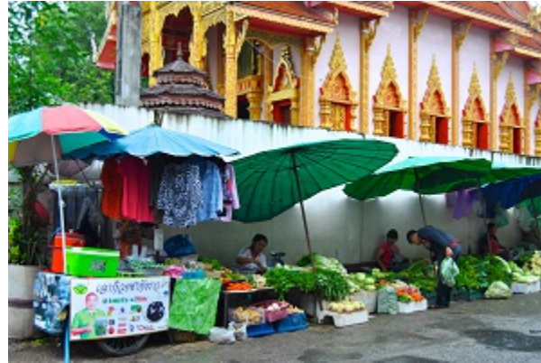
Food stands outside one of the 40,700 Buddhist temples in Thailand.

As with many cultures of Southeast Asia, Bangkok’s elderly informants stressed the importance of family support and care of the elderly. In every interview I conducted, informants expressed that it is in Thai blood, or Thai ways, to be good to your parents. One elderly respondent explained to me that this idea comes from the belief that, “If you do good, you will get good result. If you do bad, you will get bad result. So one of the really, really good causes is to take care of your parents. So if you do that cause, we will get many, many of the good things to our life.” The elderly also play a major role in the family dynamic. As a healthcare professional noted, the elderly often “take care of their grandchildren because parents have to work. So they play an important role in the social capital for the family.”