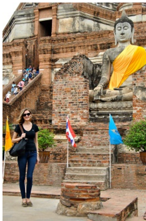
The author in Ayutthaya, the capital city of the ancient Kingdom of Siam.

This approach is especially relevant for the elderly, considering that people over sixty-five are the fastest growing segment of the population in most developed and developing nations (Luborsky and Kurn 1999). This demographic change is placing strain on the international economy as well as national healthcare systems and social welfare programs, thereby prompting the implementation of new policies regarding elderly care across many countries and cultures. Many long-standing policies, like the U.S. Older Americans Act (OAA) of 1965, promote “aging well,” “helping to maintain the health and well-being of seniors,” and “meeting the needs” of the elderly population, as stated in the OAA Brief released by the U.S. Department of Health. Yet, elderly populations carry a variety of culturally-specific views of “aging well.” As such, standardizing healthcare and health policy for the elderly, both within individual countries as well as