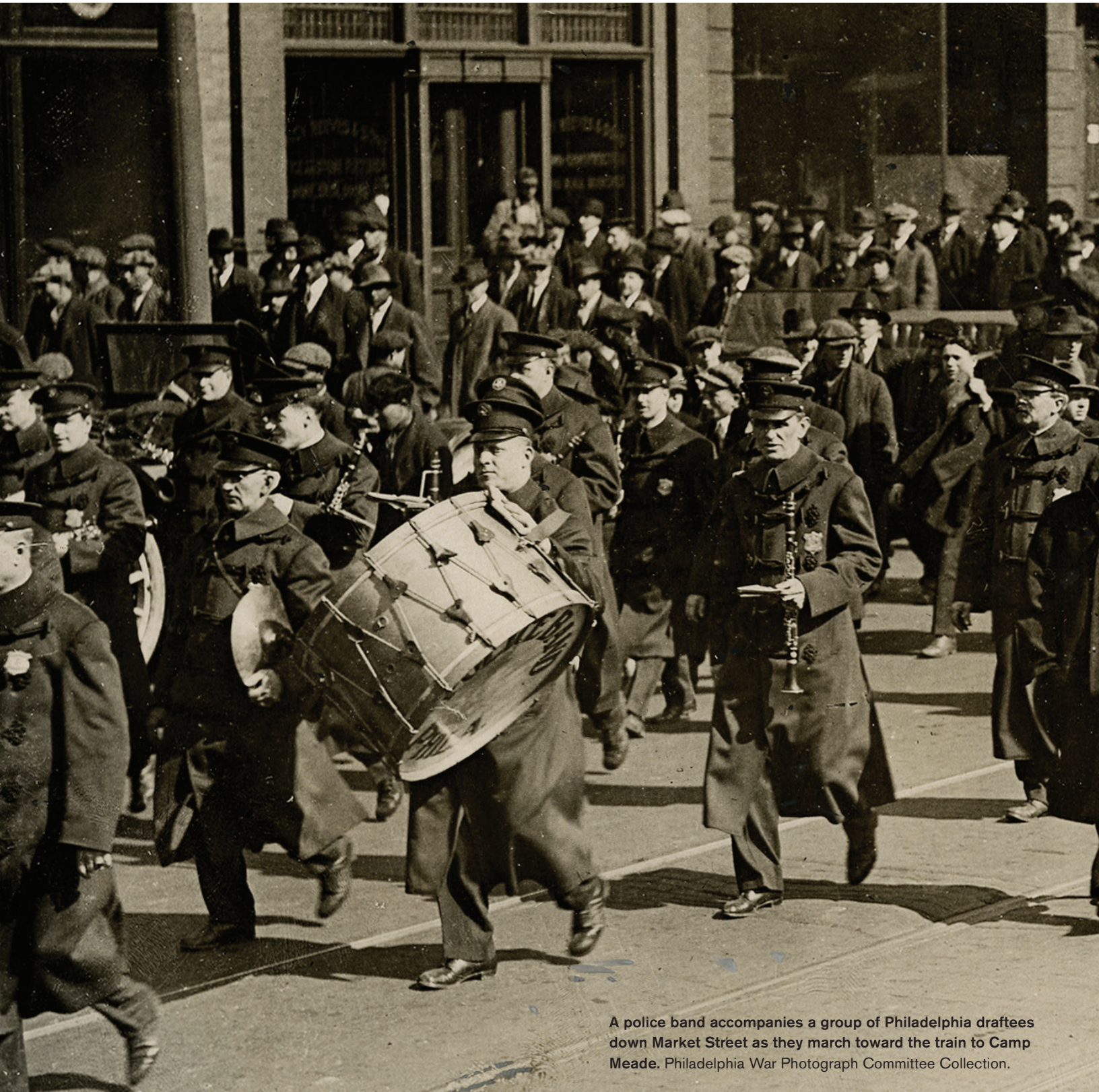
A police band accompanies a group of Philadelphia draftees down Market Street as they march toward the train to Camp Meade.

The Experiences of Pennsylvanian and Other