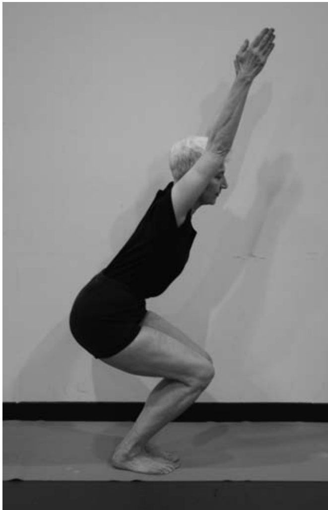
Fig. 2. Utkatasana (Fierce Pose).

approach, and is instantly experienced by the practitioner.