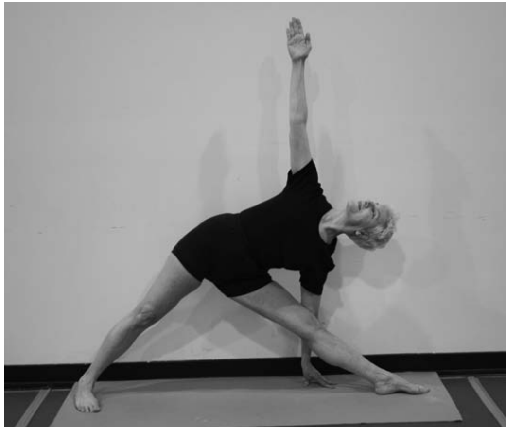
Fig. 3: Utthita Trikonasana (Triangle Pose).

accelerates as you feed it; and more is required for new asanas . However, even with the familiar Trikonasana , a new frame can effect a major reformulation. Then, steady practice clears the path: “Where the inner energy can flow, there the intelligence can enter” [18].