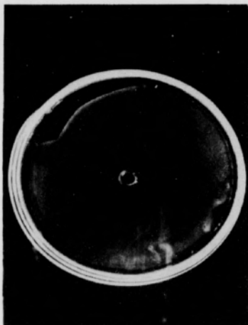
Plate No. 3

Zone of Inhibition Produced by a 0.2 % Solution of White Crystalline Substance (Test Organism - Micrococcus aureus )