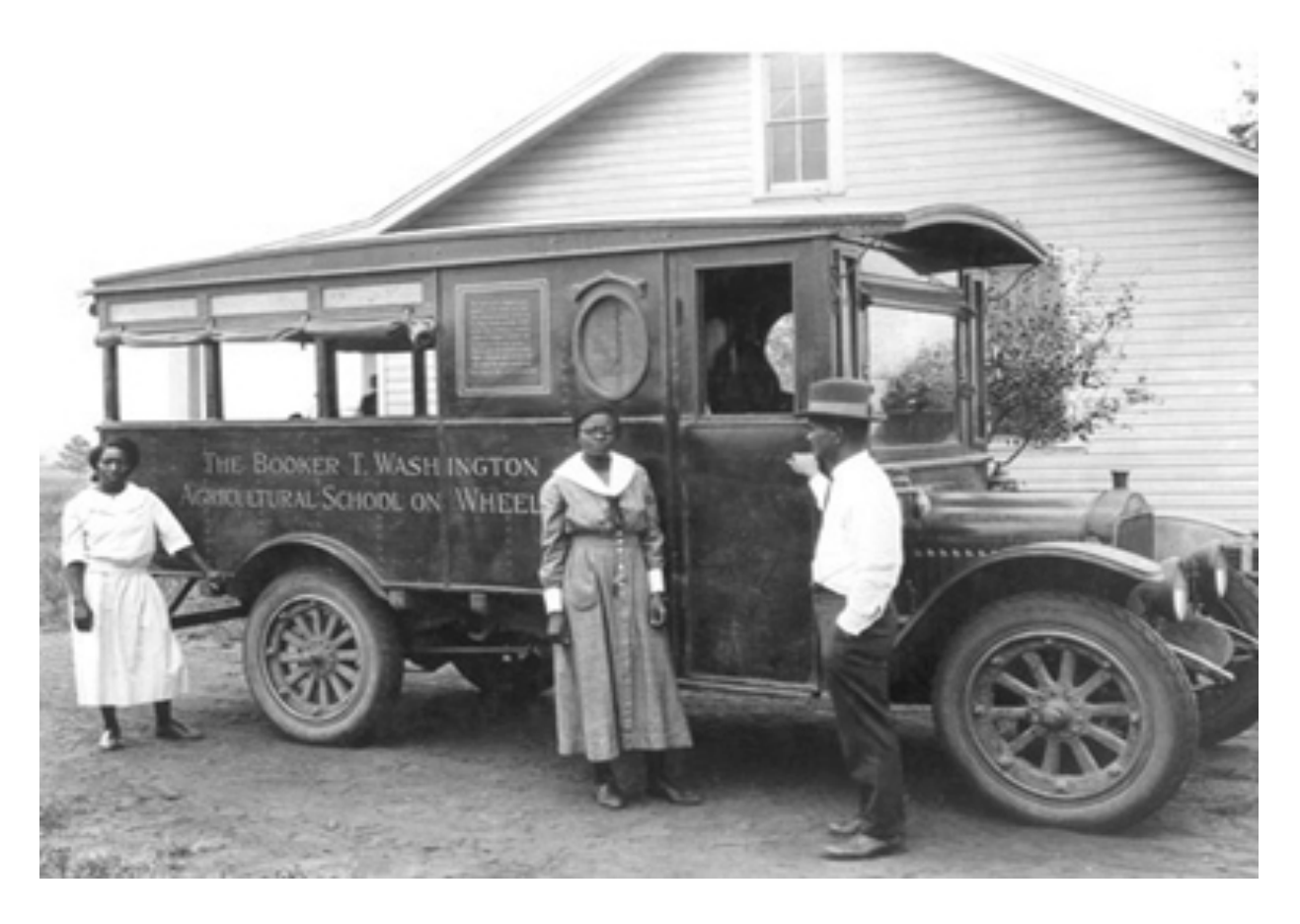
Figure 3: Tuskegee Institute "Movable School"