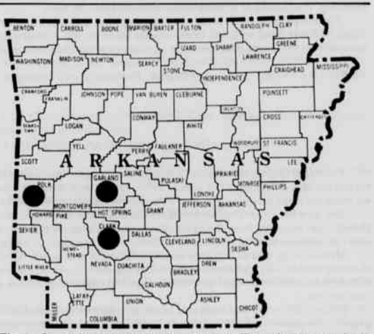
Figure 1. Arkansas distribution map of Trypethelium mastoideum Ach.

Figure 2. Arkansas distribution map of Trypethelium tropicum (Ach.) Müll. Arg.