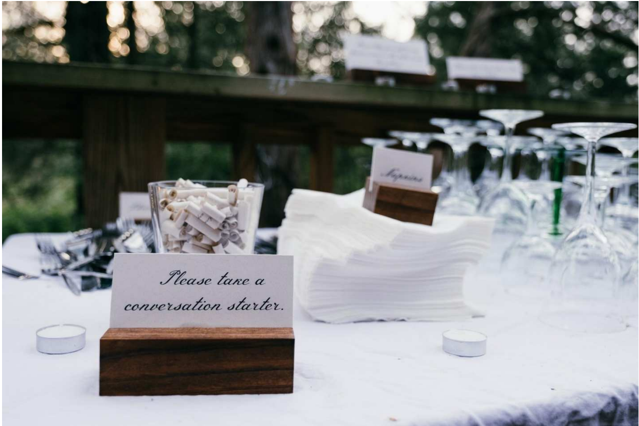
Figure 7. Installation view of DINNER .