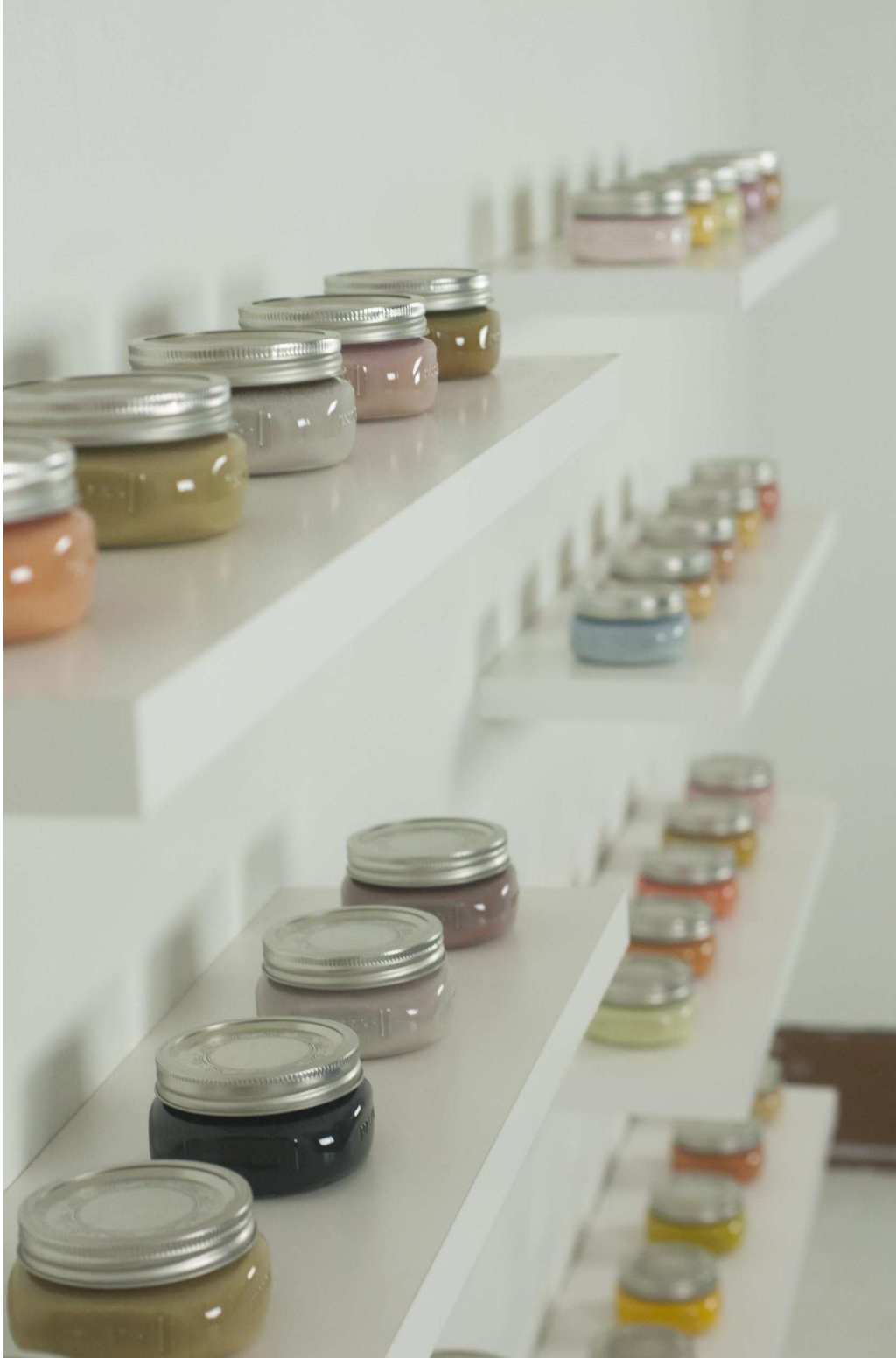
Figure 6. Installation view of In Sickness and In Health .