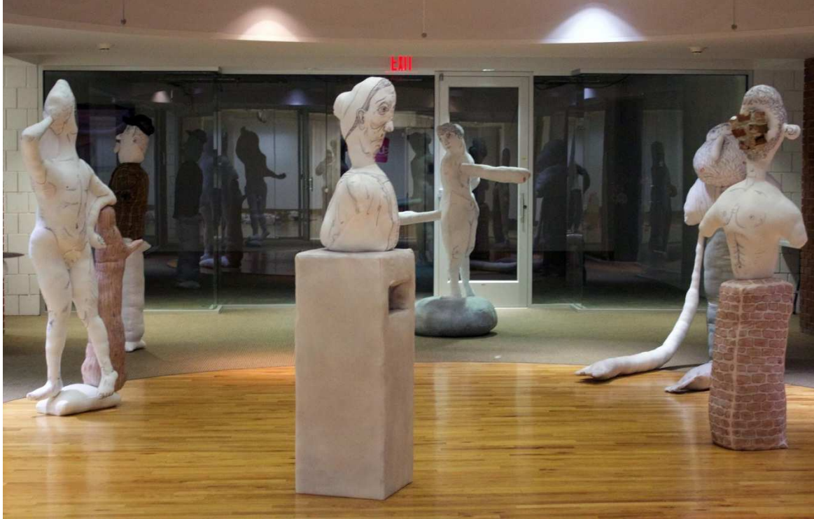
Figure 4. Installation view of On Loan .