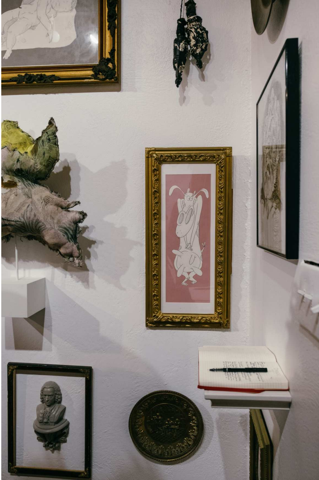
Figure 10. Installation view of DINNER .