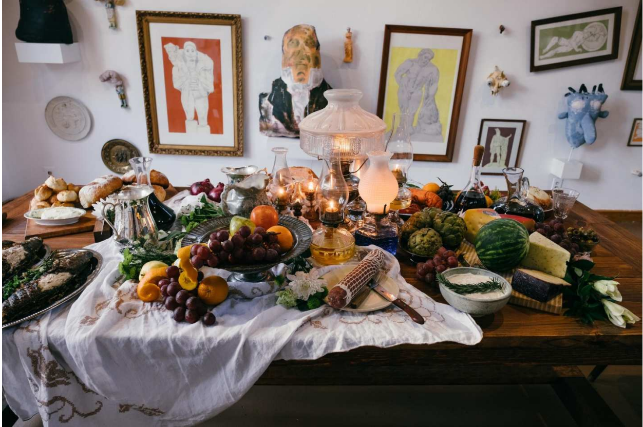
Figure 3. Installation view of DINNER .