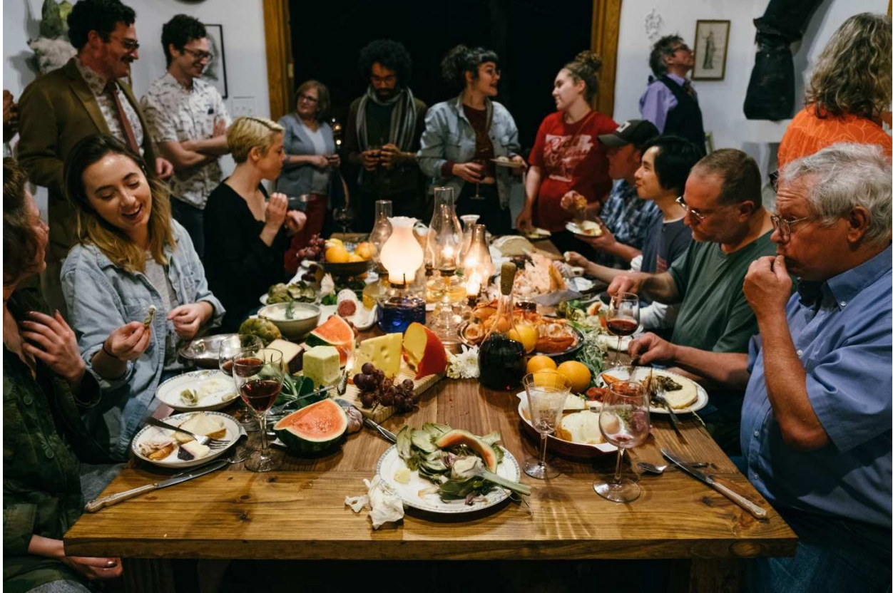
Figure 5. Installation view of DINNER .