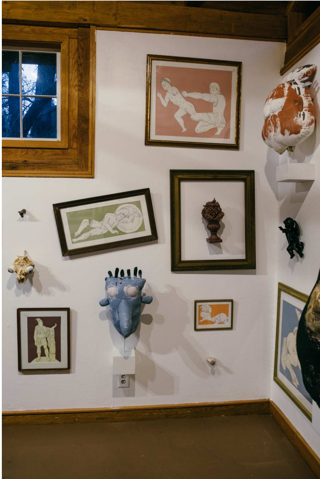
Figure 9. Installation view of DINNER .