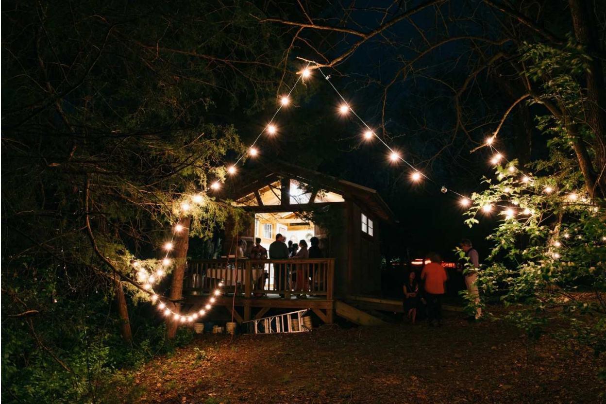
Figure 1. FEAST Gallery.