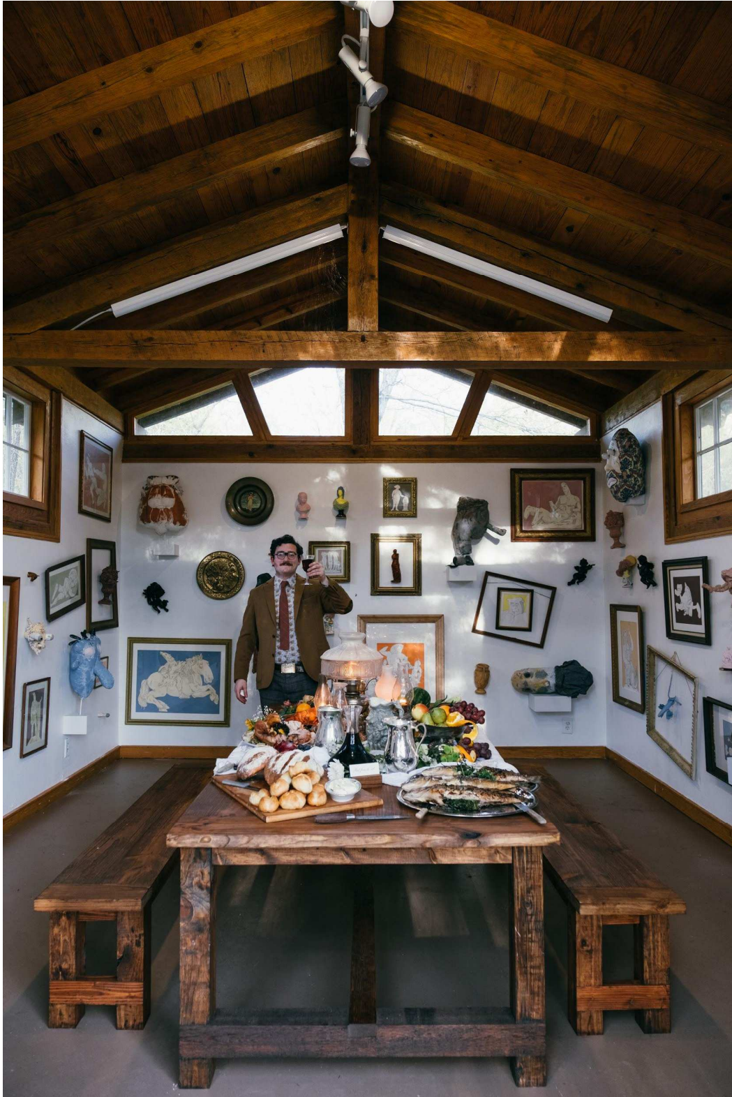
Figure 2. Installation view of DINNER .