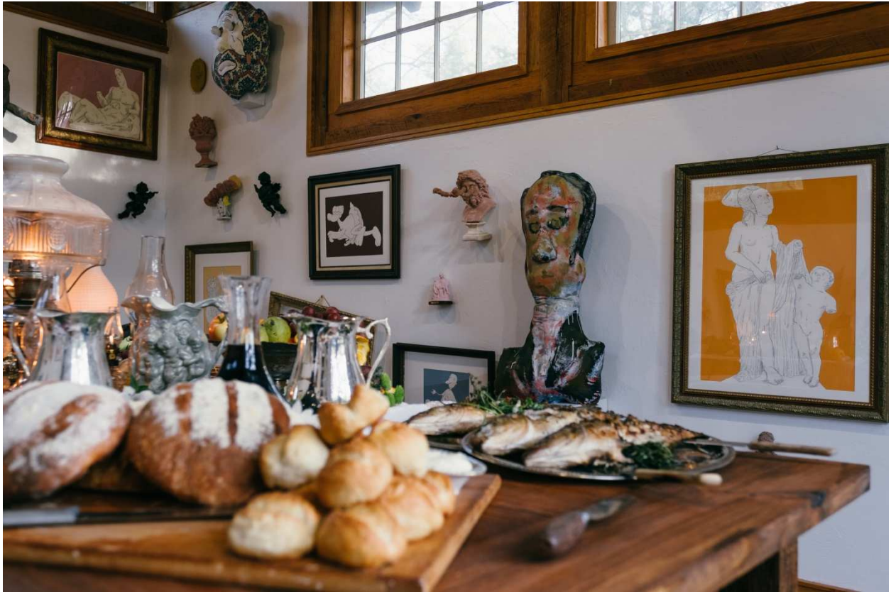
Figure 8. Installation view of DINNER .