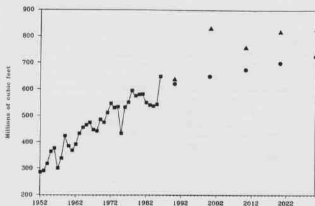
Figure 1. Past ■, USFS projected, ▲, and Arkansas Timber Study Committee projected, ●, production for Arkansas forests.

tional 39 cubic feet per acre per year. In addition to increased growth and yield, additional forest cultural work would create jobs for Arkansas. However, most positions would be seasonal labor requiring little skill.