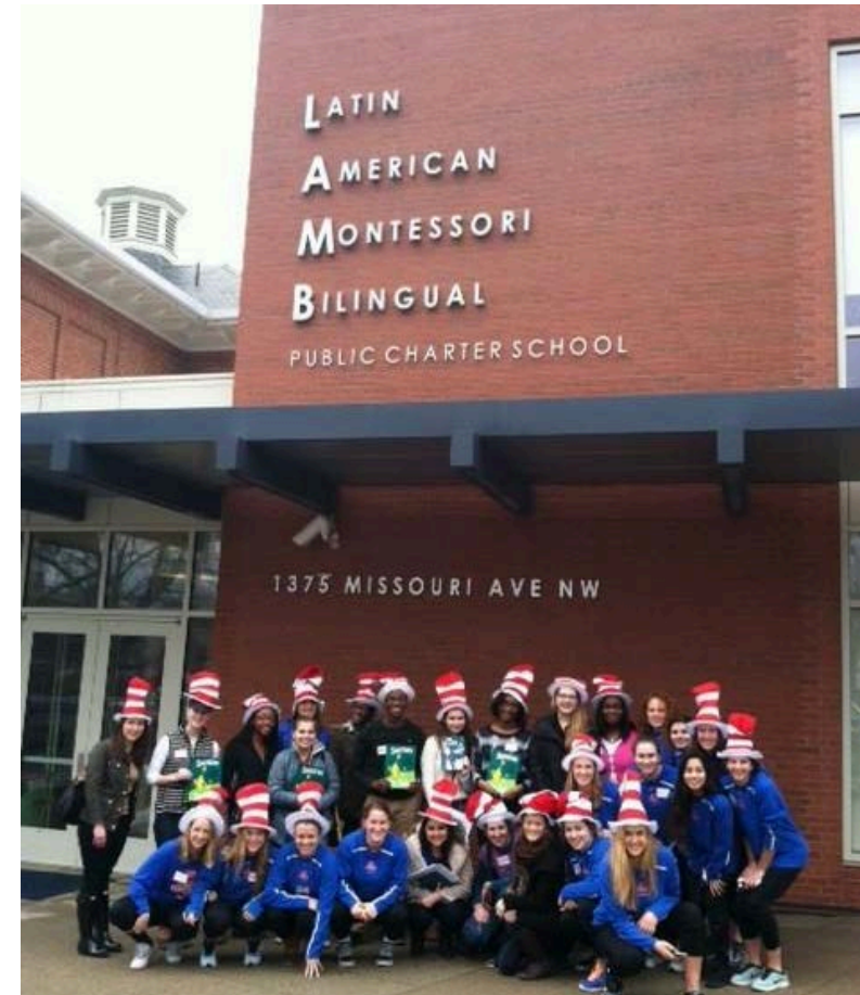
AU CCES Facebook, 2015