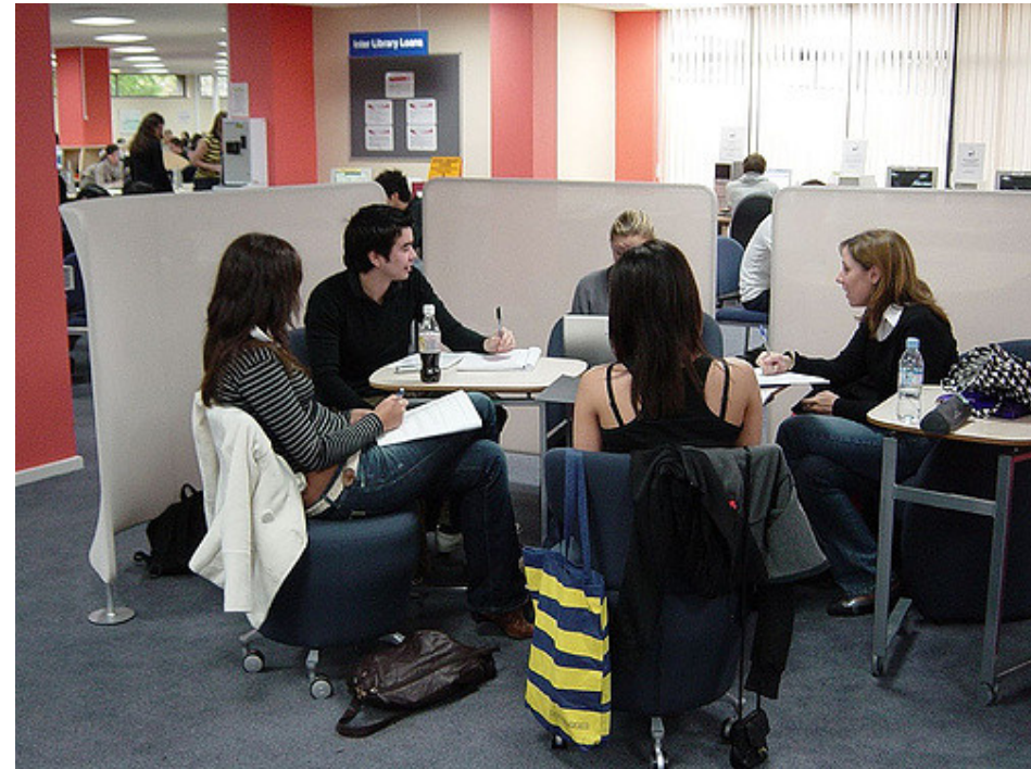
Northumbria University, 2006