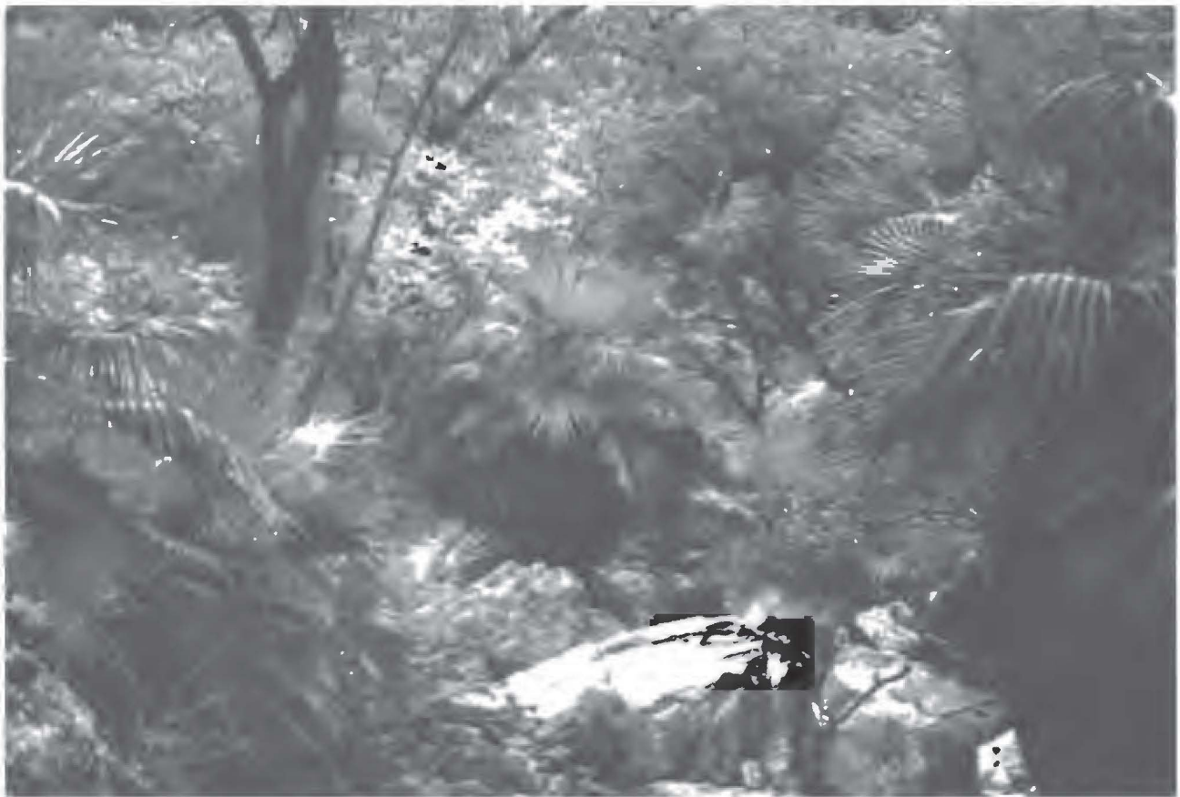
Fig. 7. Brahea nitida . Northeastern Sonora, Rancho Pinalito, Sierra Torro Muerto. Photo by E. J., August 1993.

ently also on rhyolite; growing in crevices or among rocks on steep slopes, sheer cliffs, and canyon walls, and less often along canyon bottoms. The northernmost populations are in riparian canyons in Sonoran Desert-oak woodland ecotone in northeastern and north-central Sonora (Fig. 6, 7). This palm also occurs in widely scattered mountain canyons east of the Sonoran Desert. In southeastern Sonora it is sometimes common in narrow, riparian canyons and on cliffs in tropical deciduous forest, oak woodland, and pine-oak woodland or pine forest.