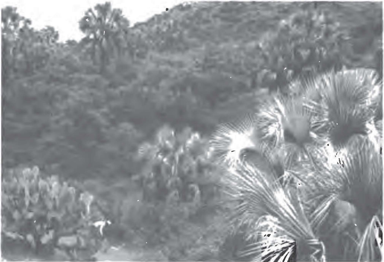
Fig. 8. Sabal uresana . Northeastern Sonora, Municipio de Nácori Chico, Rancho Napopa. Mesquite–grassland–Sonoran Desert vegetation. Note the costapalmate, curved leaf blades of the immature palm in lower right. Photo by E. J., August 1993.

blackish; seeds 10–16 mm in diameter, 4–10 mm in height, depressed-globose, dark red-brown (“chestnut”) to blackish, glossy. Flowering April to June, mostly in May; fruits ripening in August in the desert, and September and October in the mountains. 2n = 36 (Eichhorn 1957).