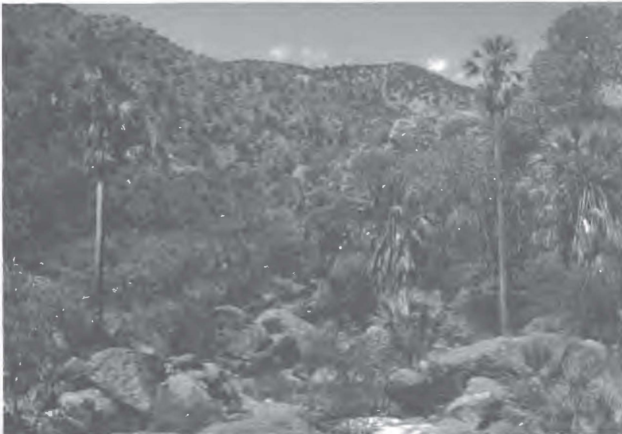
Fig. 5. Brahea elegans . North-central Sonora, Sierra de Nacozari, upper margin of Sonoran Desert and oak woodland vegetation with many riparian species; collection site for Felger et al. 3288. Photo by R. S. F., June 1960.

those in east-central Sonora but seem to be somewhat less robust than those of northeastern Sonora. The leaf blades are generally tougher and much duller (“whiter”) than those of the east-central and northeastern Sonora populations.