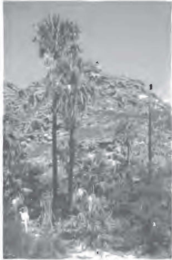
Fig. 4. Brahea elegans . West-central Sonora, Cañón Las Barajitas. The tallest palm is Sabal uresana , the others are B. elegans . Photo by R. S. F., 1995.

Inflorescences 10–12 per tree, mostly longer than the leaves, 205–340 cm long. Bractlets 1.0–1.5 mm long. Flowers (1)2 or 3 in clusters. Sepals 1 mm long, thin, cupped, broad, and scarious. Corollas sympetalous below, the lobes 1.6 mm long, thick and broadly deltoid. Filaments short and slender. Fruits rounded, (15.8–)18.0–19.5 mm maximum diameter. Seeds 14.5–