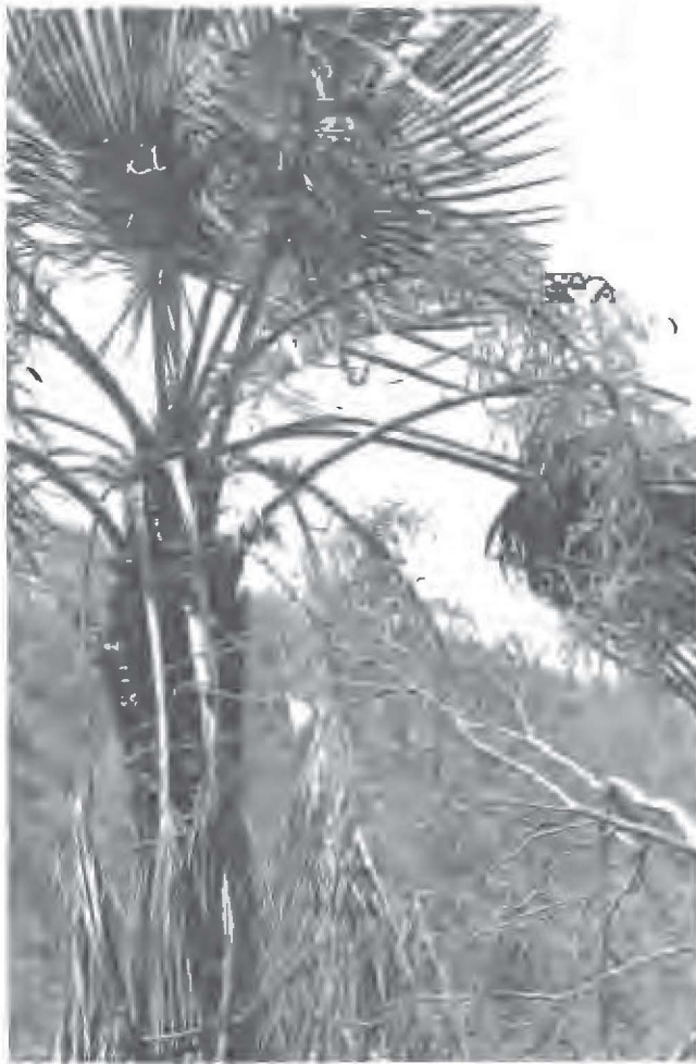
Fig. 3. Brahea dulcis Rancho Santa Bárbara.