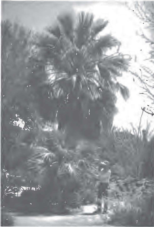
Fig. 2. Brahea aculeata and B. elegans at Arizona-Sonora Desert Museum, Tucson. Grown from seed collected in 1970, and planted simultaneously in 1972 from one-gallon containers. Brahea aculeata , smaller palms on left, from the vicinity of Sabinito Sur, east of Alamos, and B. elegans , on right, from Cañón del Nacapule. Photo by R. S. F., April 1998.