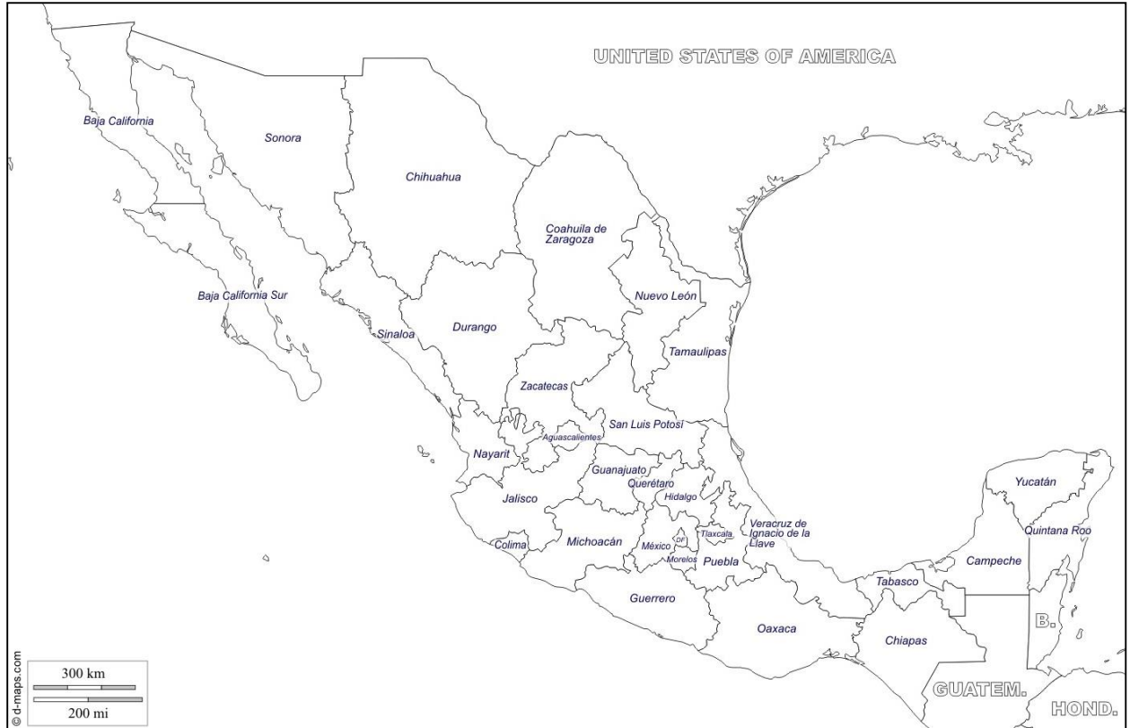
Figure 1: States of Mexico 199