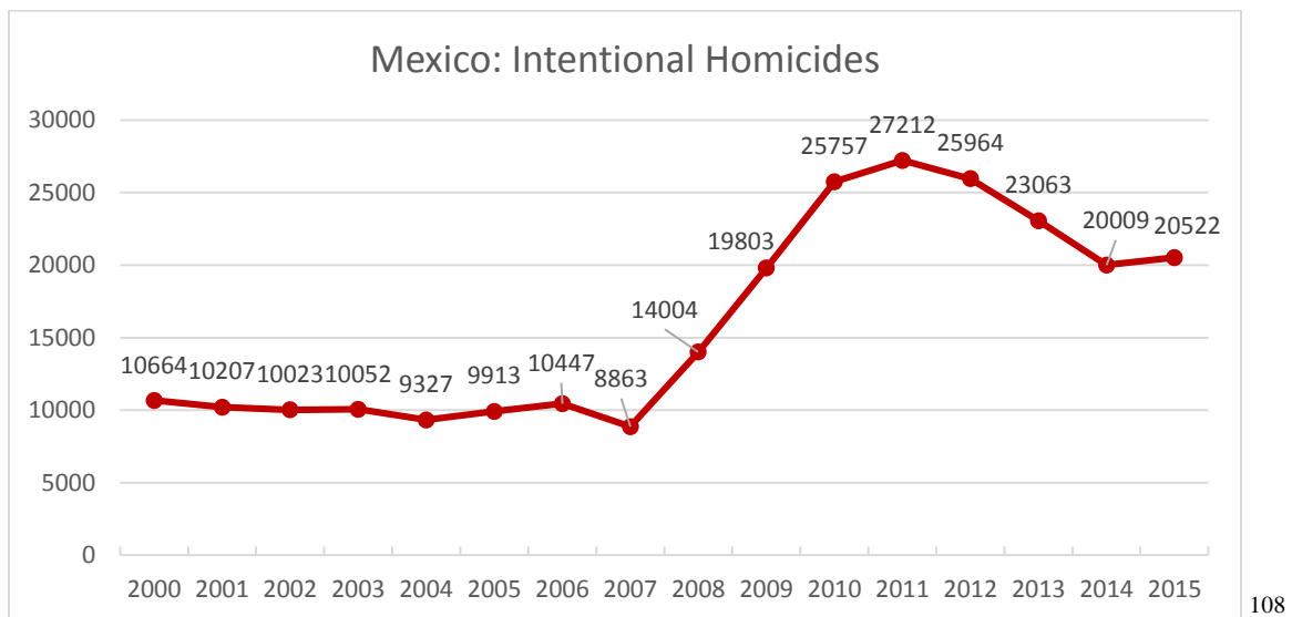
Instituto Nacional de Estadística y Geografía (INEGI)

Using intentional homicide figures from INEGI, one can see the clear increase in violence in the country. Between 2000 and 2015, intentional homicides increased by 104.75%. 106 This figure even factors in the decrease in violence seen since the election of President Enrique Peña Nieto in 2012. If only looking at 2000 through 2011, intentional homicides increased by 155.18%. 107