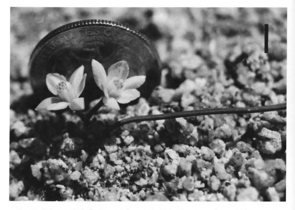
Fig. 1. Close-up of Muilla coronata flowers displaying the crown of petaloid filaments. The diminutive size of this lily is readily apparent when compared to the quarter used for scale which is 23 mm in diameter. Scape is less than 3 cm above the sandy granitic gravels and the plant has only one leaf. (Bar, upper right = 5 mm.)

coated corm. Though the type of M. coronata (ND) shows no indication that the leaves are "several," Greene nonetheless states "leaves 2–3" in the original description.