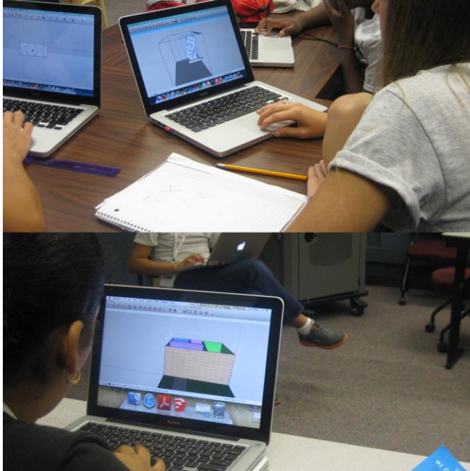
Figure 1. Representative images of students' object design in a 3D modeling software

The second most frequent answer was about the construction engineering course.