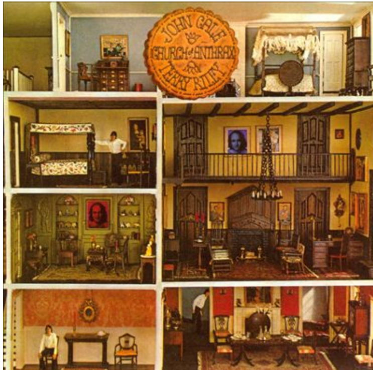
Figure 3 – Terry Riley and John Cale's Church of Anthrax

electronic music of the late 1960's and early 1970's. 93 Indeed, Reynolds explicitly notes that Kraftwerk were, "inspired by the mantric minimalism and non-R & B rhythms of the Velvet Underground." 94 Further, Cale was heavily involved in Riley's Church of Anthrax (actually billed above Riley on the album's cover), which Hoenig noted above as his concrete entryway into minimalism [Figure 3].