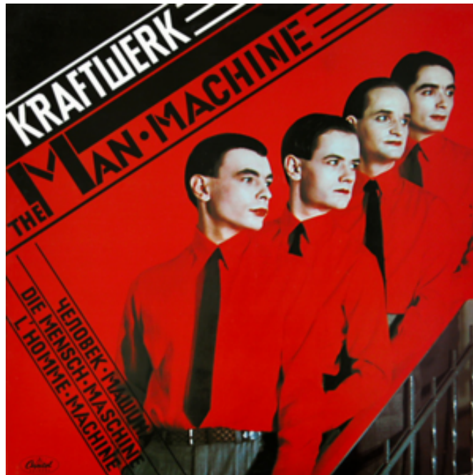
Figure 4 – Kraftwerk’s “The Man-Machine”

Kraftwerk were actively involved in exploring the limits of objectivity in music, using robots, cyborgs and machines as a constant motif throughout their album covers, titles, performances and musical output [Figure 4].