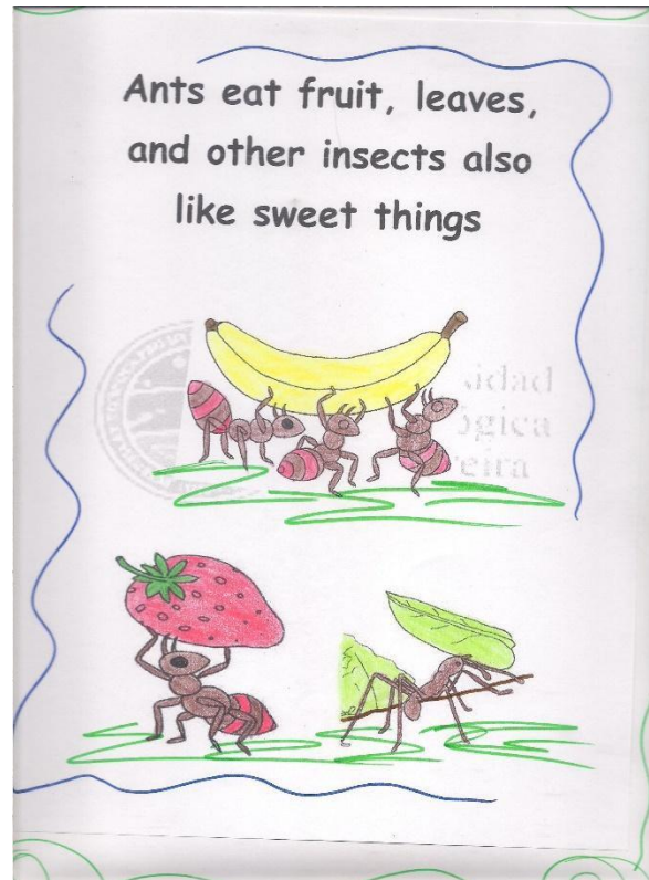
Worksheet B: the living cycle of the ant