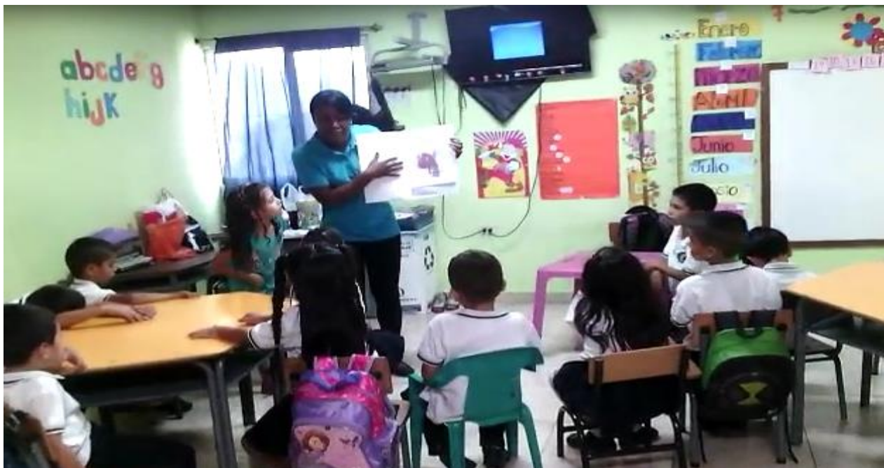
Flashcards A: presenting vocabulary to the learners using flashcards