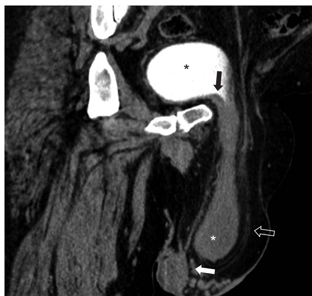
Figure 2 - Curvilinear multi-planar reformatting shows the fluid filled tubular structure extending from the urinary bladder (*) into the scrotal sac, with wall thickening (black arrow) and extending through the inguinal canal and displacing the testis (white arrow). The lining of the inguinal canal (hollow arrow) is seen separating the herniated fat tissue from the subcutaneous fat plane. The urine contained in the herniated bladder (white *) is not opacified because the wall thickening is obstructive to the passage of contrast.

Ultrasound scan may show no communication between the bladder and the scrotum (Fig. 1) or only a small beak-like indentation of the bladder. 2-3 Even if a communication is