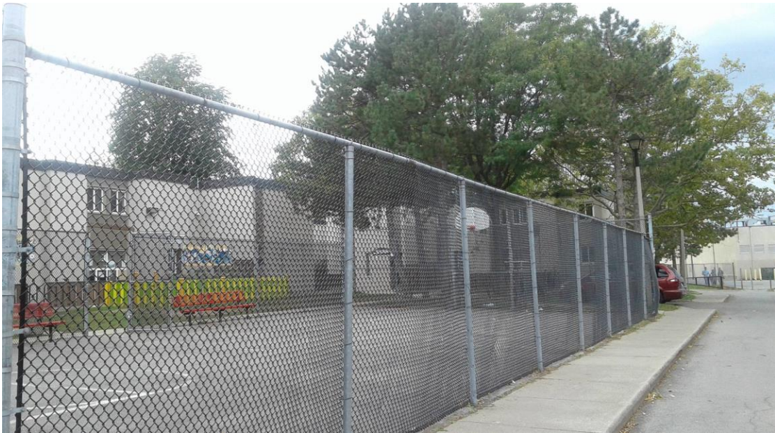
Figure 1. Liberty Village court South Western view