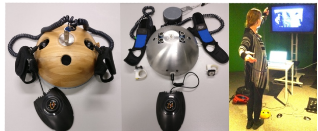
Figure 2: The Haptic Bowl (left), Non-haptic Bowl (center), and User for Scale (left).

The Non-Haptic Bowl is also an isotonic, zero-order, alternative controller, based upon PING))) ultrasonic transducers and basic infrared (IR) motion capture (MOCAP) cameras. The components are arranged as digital inputs, via an Arduino Micro, and MOCAP cameras are attached via an integrated USB hub. The MOCAP system is crafted from modified Logitech C170 web cameras with internal IR filters removed and visual light filters covering the optical sensors. An IR light emitting diode (LED), embedded in a ring, is then used to provide a tracking source for the simple MOCAP system. The constituent components are contained within an aluminium shell, similar in size and shape as the Haptic Bowl. The use of these sensors best matched the input capabilities of the Haptic Bowl, ensuring a comparable interaction. However, the device has fewer movement restrictions than the Haptic Bowl, as no physical contact is required.