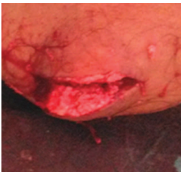
Figure 2. After incision: densely calcified and friable nodule.

The Regional Committee for Medical and Health Research Ethics did not require ethical approval for reporting individual cases. Written informed consent was obtained from the patient