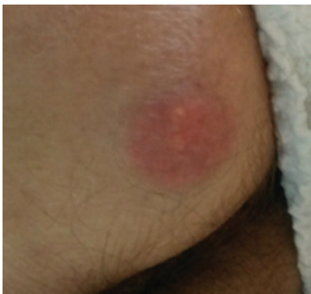
Figure 1. Painful erythematous 3-cm nodule on the right buttock containing 2 yellow-white circular structures.

allopurinol treatment (300mg daily), with normal serum uric acid level (230 μmol/L, normal range 202–416 μmol/L). A postoperative CT scan after the last chemotherapy cycle showed the presence of calcium deposits (same density as the femoral bone) in a similar gouty tophus on the opposite buttock without signs of infection (Fig. 4). The wound healed slowly initially due to a combination of malnutrition, chemotherapy, and infection. A wound infection with Enterococcus faecium was treated with antibiotic therapy (carbapenem for 7 days) and local therapy. At 6-week follow-up the wound showed good granulation tissue and was healing well by secondary intention. The patient was instructed to continue anti-hyperuricaemic treatment.