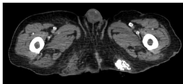
Figure 4. CT scan showing the presence of calcium deposits on the left buttock (same density as the femoral bone). CT = computed tomography.

Gouty panniculitis belongs to differential diagnosis in gout patients with subcutaneous tissue lesions of any location. It represents an unusual clinical manifestation of gout, characterized by the deposition of MSU crystals in the lobular hypodermis. [9,10] It is an extremely rare presentation, and to date, less than 10 cases are reported in the literature. [11] The pathophysiology is presently poorly understood. Ochoa et al [10] suggested that localized inflammatory changes in the lobular subcutaneous tissue may be triggered and perpetuated by disruption of the arterial blood supply by MSU crystals and microtrauma of the terminal capillary wall and adipose tissue, thus rendering tissue vulnerable to deposits. Serum uric acid levels seem not to be directly related to the development of gouty panniculitis, especially in diabetics or alcoholics. [12] On physical examination, patients present with erythematous, irregular, and deep indurated subcutaneous nodules, causing pain or tenderness. These clinical findings may precede or appear subsequently to articular tophaceous gout. [1] The differential diagnosis includes a wide spectrum of clinical disorders like cellulitis, cutaneous abscess, systemic lupus erythematosus, dermatomyo-