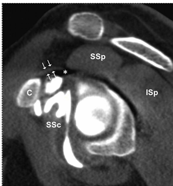
Fig. 2. 55-year-old patient addressed for suspicion of cuff rupture, with a normal CT arthrography. Sagittal oblique reconstruction at the level of the coracoid tip (c). The rotator interval (*) is free with the coracohumeral ligament lying over (white arrow). * = rotator interval; c = coracoid tip; SSp = supraspinatus muscle; SSc = subscapularis muscle.