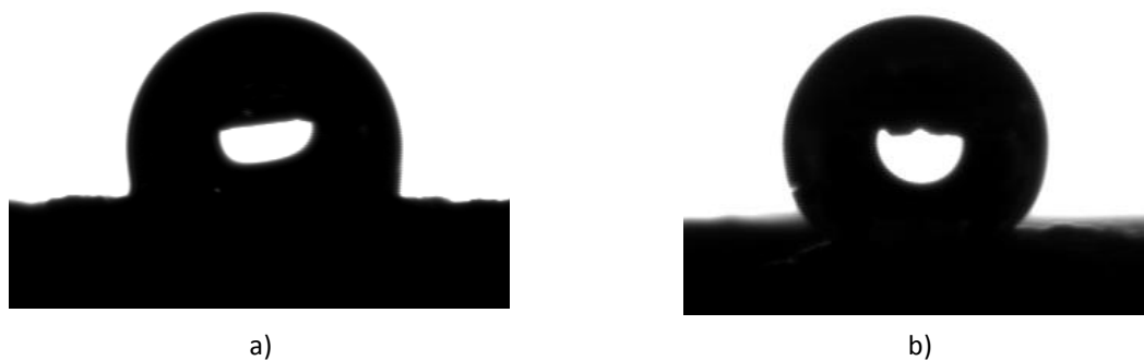
Figure 3: Water Contact Angle Image: a) AC 6; b) AC 6 TiO 2 ZnO