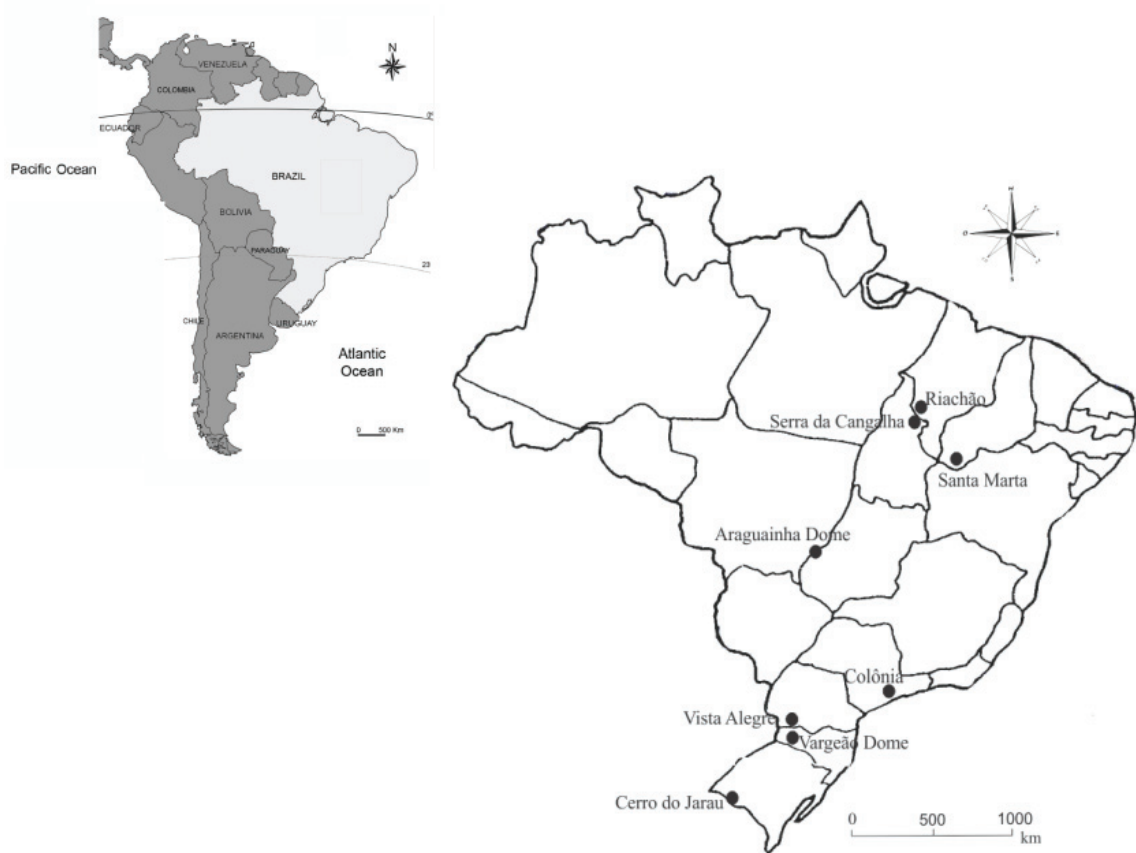
Figure 1 - General location of confirmed impact structures in Brazil.