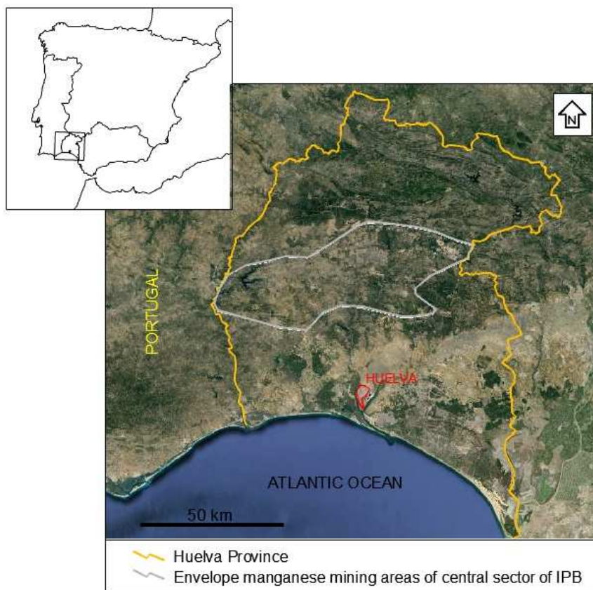
Fig. 2 – Location of study area in the central sector of Iberian Pyrite Belt, SW Spain.

There are siliceous slates grading to jasper at the top of the stratigraphic sequence [6]. Mn deposits occur in the oxidation zones over carbonates and silicates, such as rhodochrosite ( \text{MnCO}_3 ) or rhodonite ( \text{Mn}_2(\text{SiO}_3)_2 ) lenses in jasper. Also, pyrolusite ( \text{MnO}_2 ), psilomelane ( \text{MnO}_2 \cdot \text{H}_2\text{O} ), and “wad” appear at the top of the sequence as secondary ore minerals. More detailed information about the geology of Mn-oxide deposits can be found in [7] and [8].