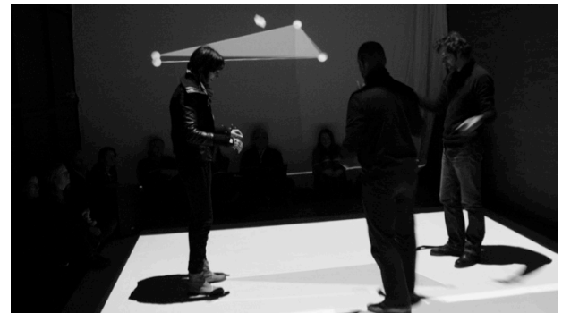
Fig. 3. Three users interacting with the demo of the 'SoundField'-platform

(Fig. 3). Eventually, the project targeted end-user and audience customization and acceptance.