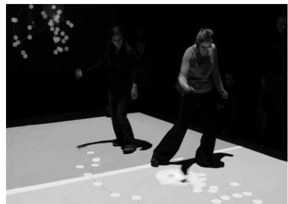
Fig. 4. Two users interacting with the 'SoundTracks'-use case

A number of demos were done between July 2010 and October 2010 with a representative and varied test audience. Here a laptop-based demonstrator of the eventual platform was presented as the developmental strategy was tested. During these sessions, ideas emerged that inspired either implementation strategies or interaction scenarios. From October 2010 to February 2011, in close collaboration with the Flanders "Youth and Music"-program, the 'SoundField'-installation was presented to a broader audience at Destelheide Arts Education centre in Dworp, Belgium.