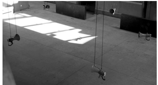
Fig. 2: the 'Lament' installation, presented at music centre Bijloke, Ghent

The second installation, 'Lament' (Fig. 2), was not designed to be experienced individually, but was intended to provoke participants to actively and collaboratively experience a sonic environment. The public could easily connect to 'Lament' because of its low threshold and iconic visual identity, which elicited interaction.