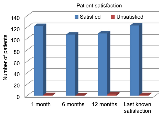
Figure 3 Patient satisfaction at 1-, 6-, and 12-months postoperative and last known satisfaction for each patient.

readjusted once each to achieve a completely flat alignment, without necessitating removal of the patch from the defect.