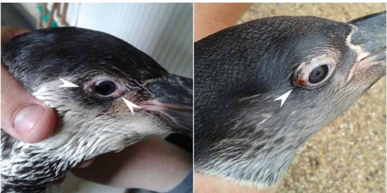
Figure 1. Nodular wart-like lesions on the eyelids of Humboldt penguins ( S. Humboldtii ) at wild animal park Planckendael, Belgium.

DNA was extracted from 200 \mu l of a 20% suspension of lesions from affected penguins and chickens,